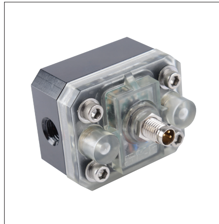
Grease flow detector 800030 shown with cable

The SKF grease flow detector is suitable for applications in steel mills, paper mills, glass plants and other heavy industries.